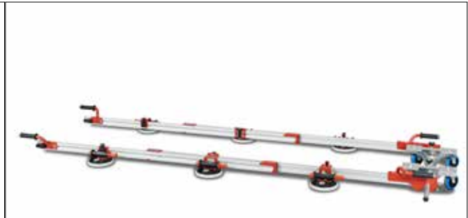
ONLY-ONE mounted on EASY-MOVE mkiv (Art 432KR02A + Art. 432EM04CA).