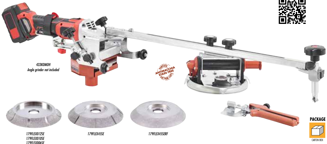
433KOMOH Angle grinder not included