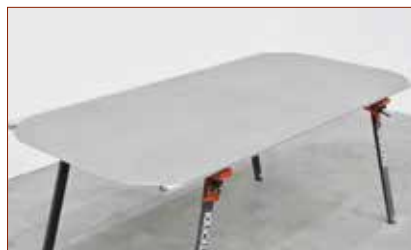
STARTING SLAB MOTOKOMPASS FINAL SLAB