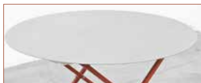
STARTING SLAB MOTOKOMPASS CUTTING GUIDE ANGLE GRINDER FINAL SLAB